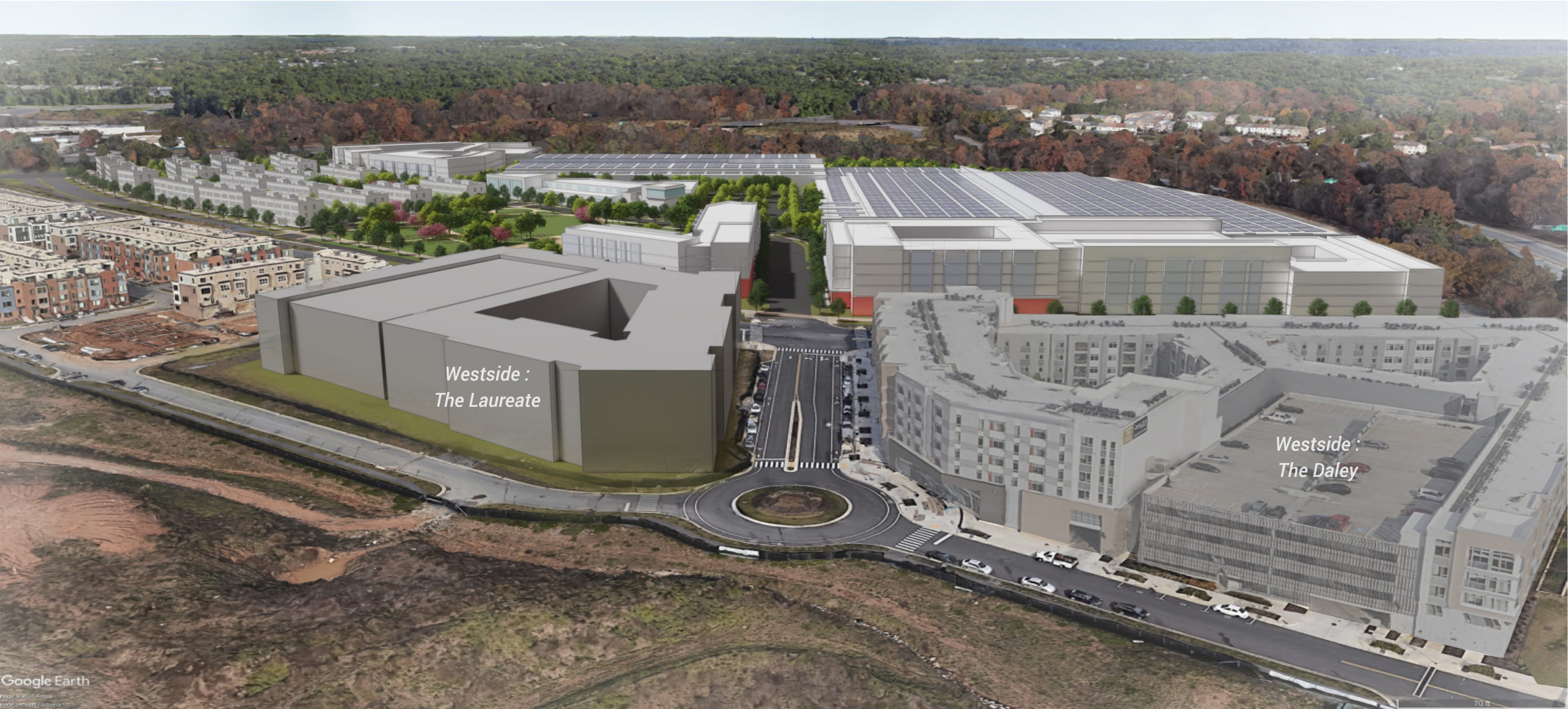
VIEW LOOKING NORTHEAST, OVER WESTSIDE MULTI-FAMILY AND GRAMERCY BLVD.