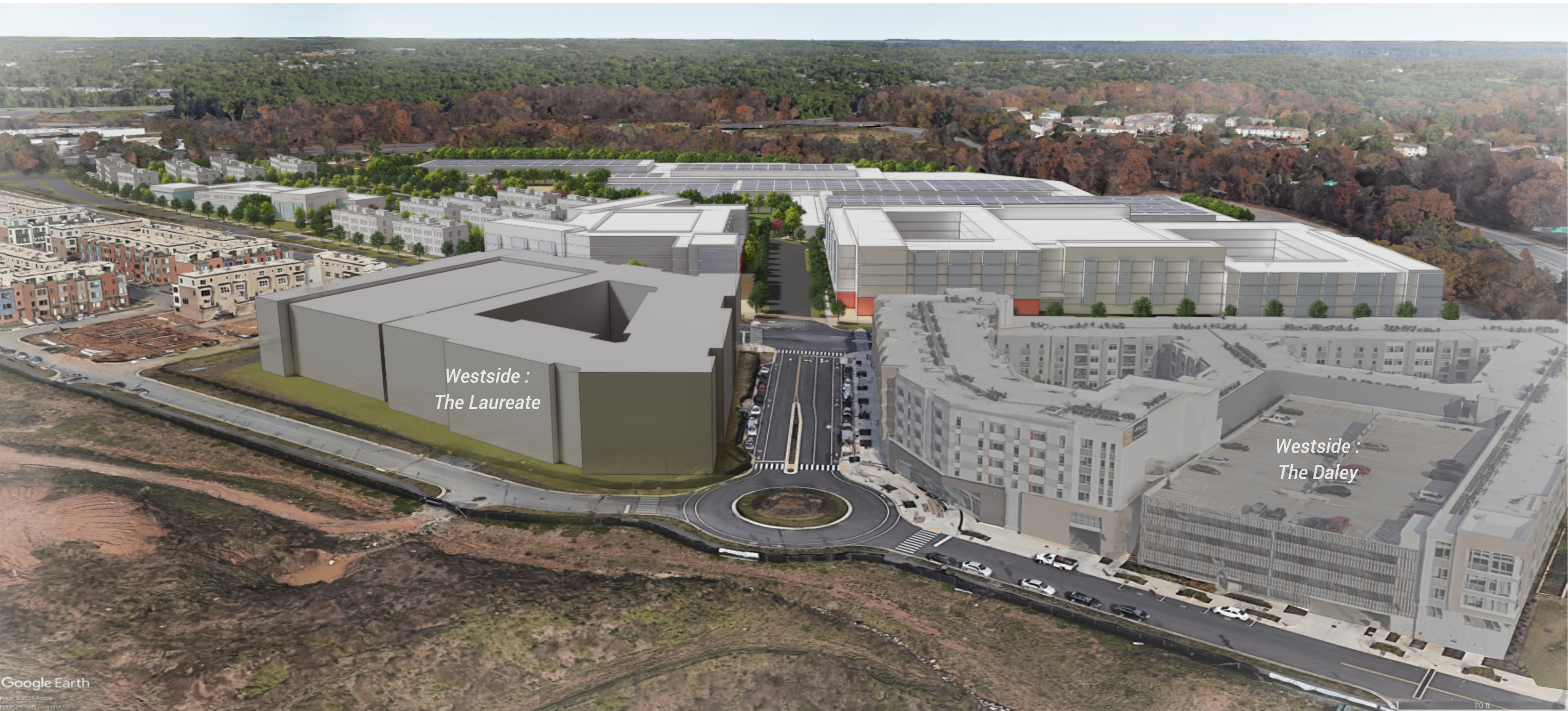
VIEW LOOKING NORTHEAST, OVER WESTSIDE MULTI-FAMILY AND GRAMERCY BLVD.