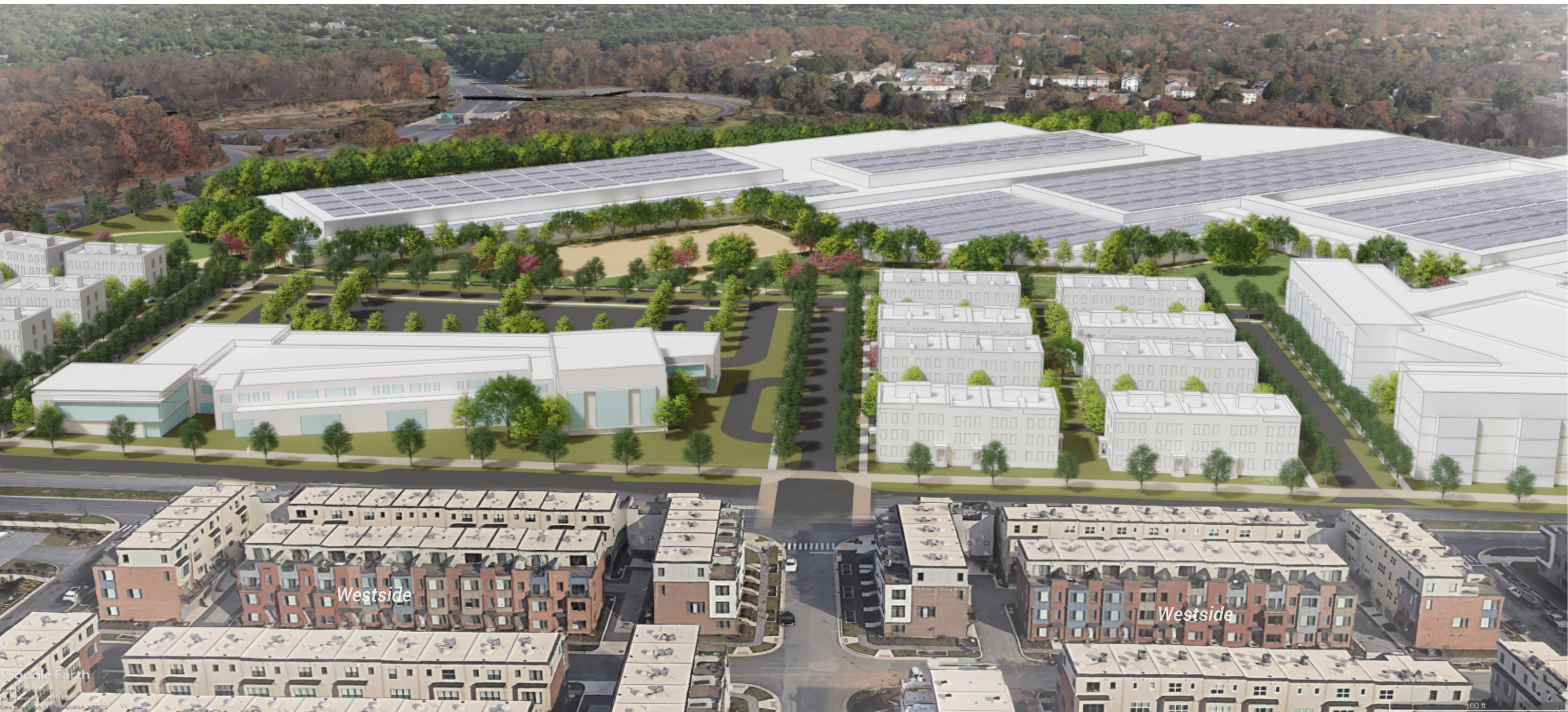
VIEW LOOKING SOUTHEAST, OVER WESTSIDE TOWNHOUSES AND TRIBECA STREET