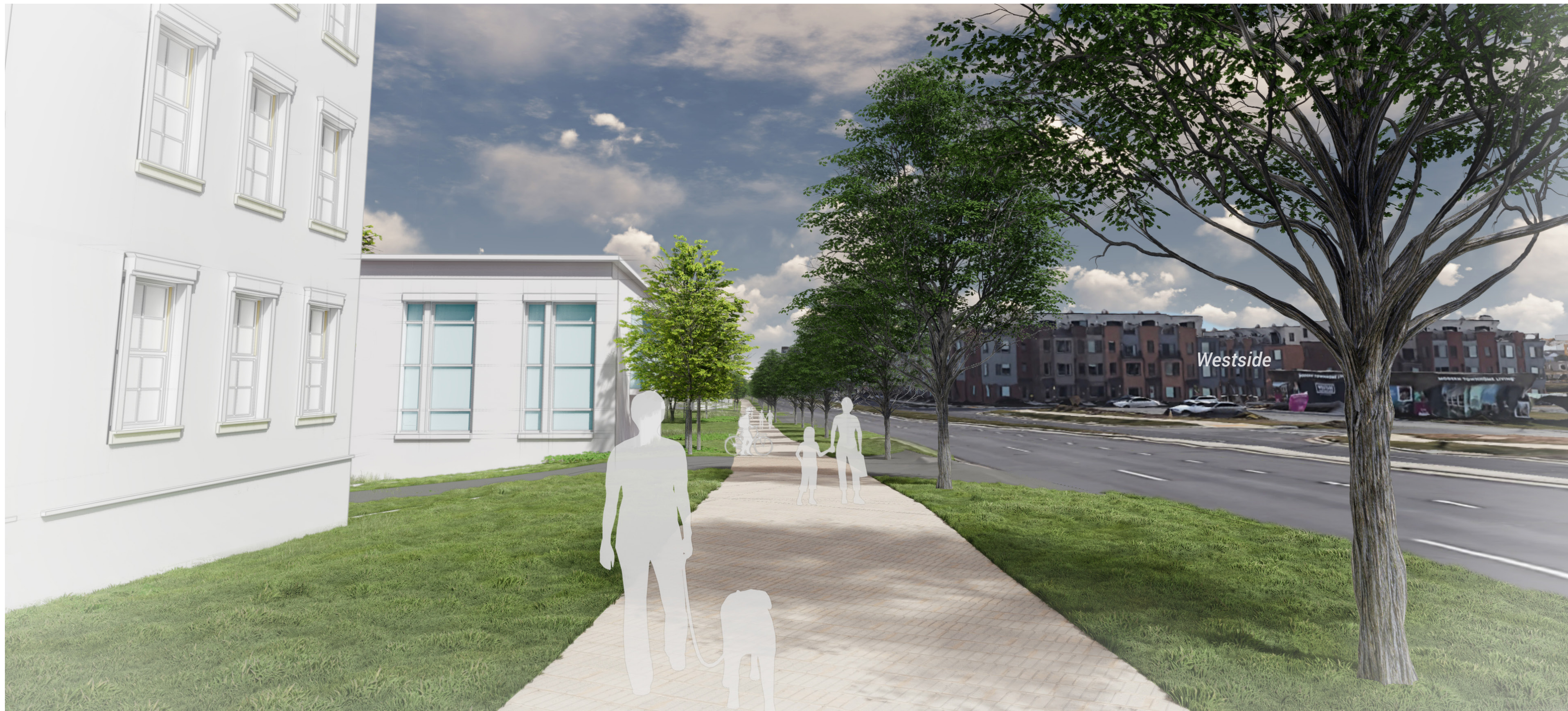
VIEW LOOKING SOUTH, FROM PROPOSED SHARED-USE PATH ALONG CRABBS BRANCH WAY