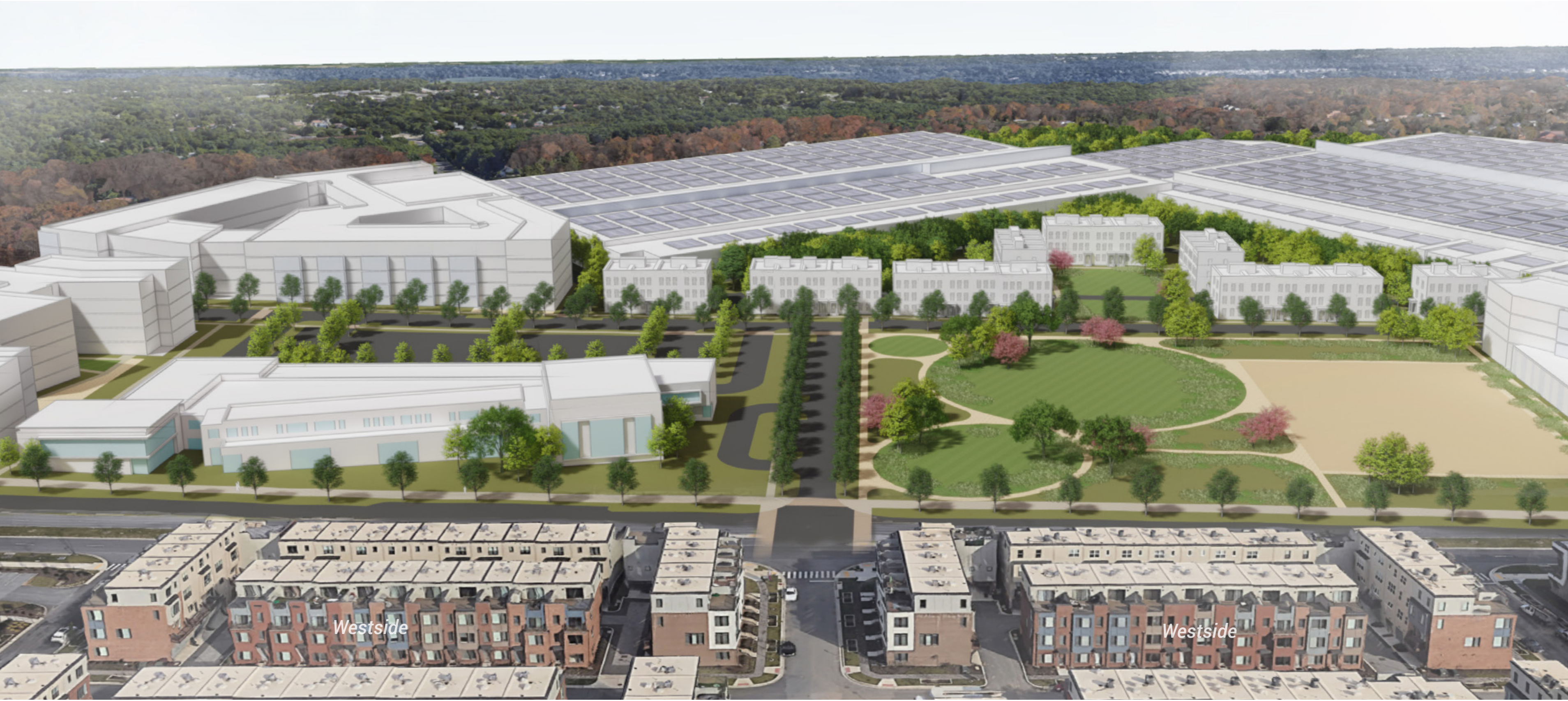
VIEW LOOKING SOUTHEAST, OVER WESTSIDE TOWNHOUSES AND TRIBECA STREET