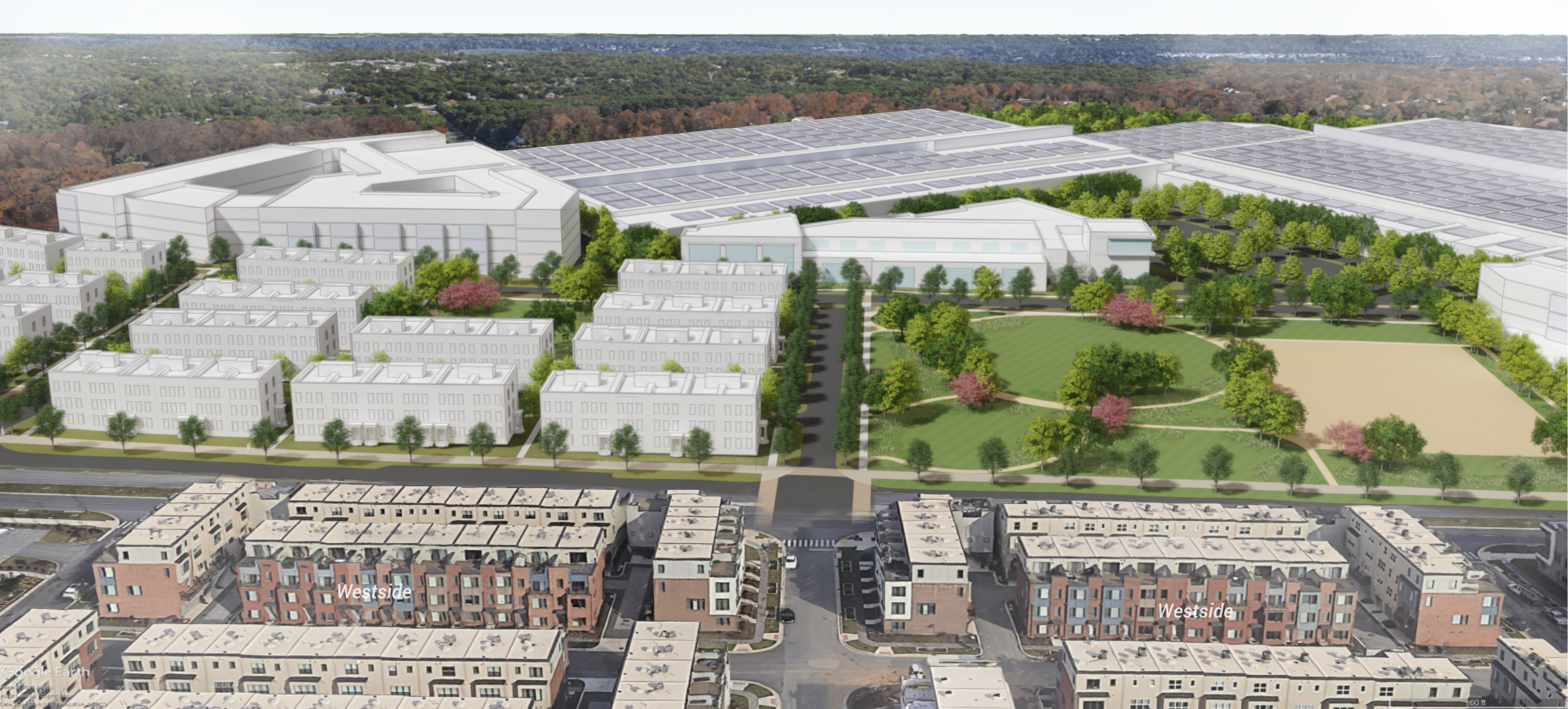
VIEW LOOKING SOUTHEAST, OVER WESTSIDE TOWNHOUSES AND TRIBECA STREET