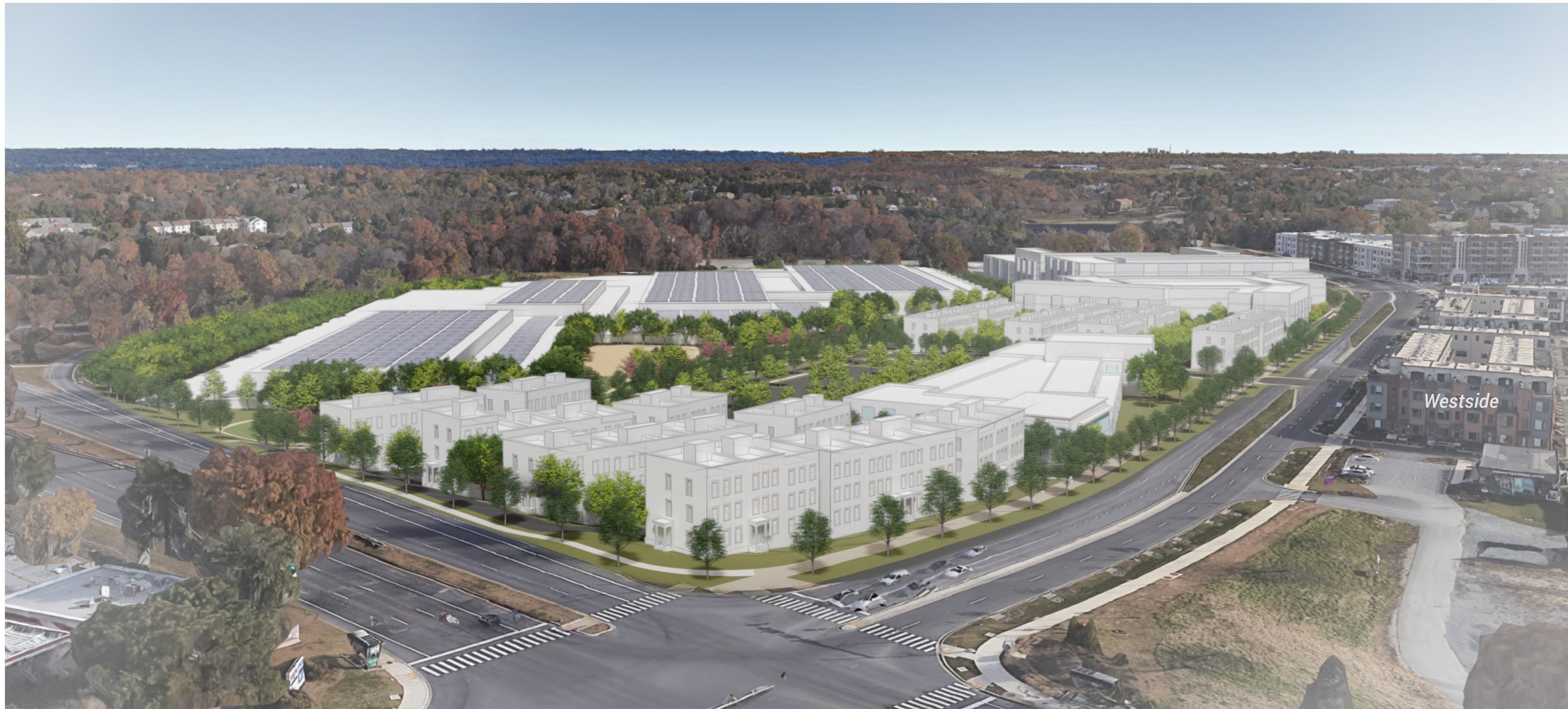
VIEW LOOKING EAST, FROM SHADY GROVE ROAD