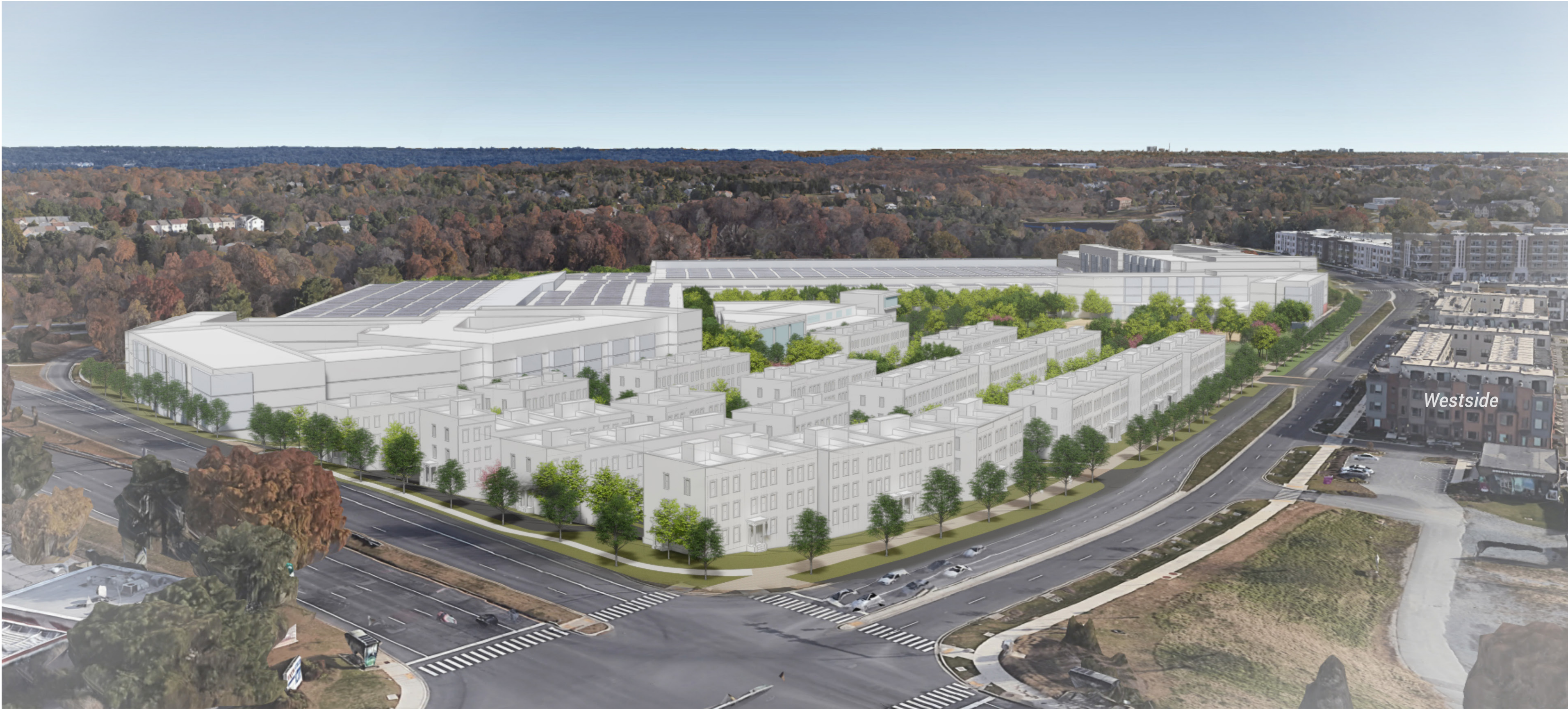
VIEW LOOKING EAST, FROM SHADY GROVE ROAD