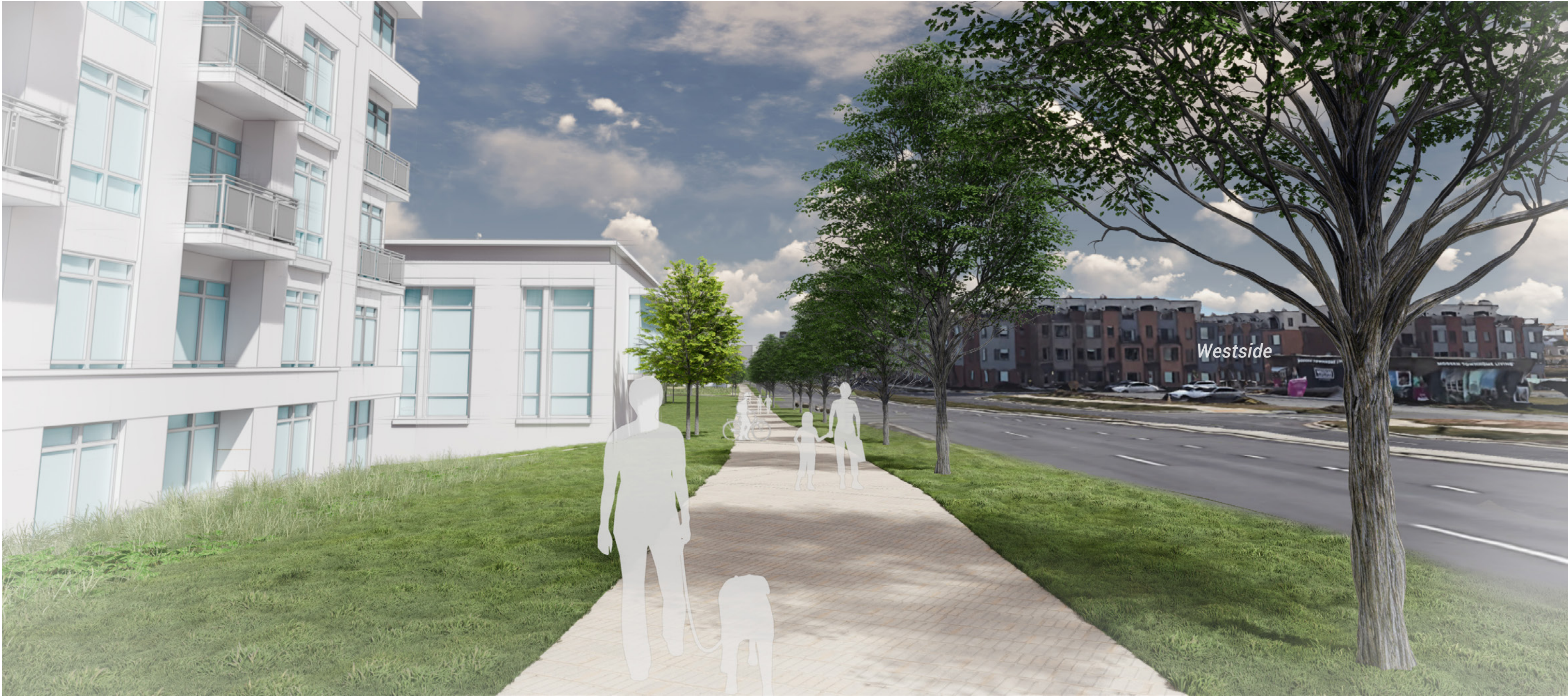
VIEW LOOKING SOUTH, FROM PROPOSED SHARED-USE PATH ALONG CRABBS BRANCH WAY