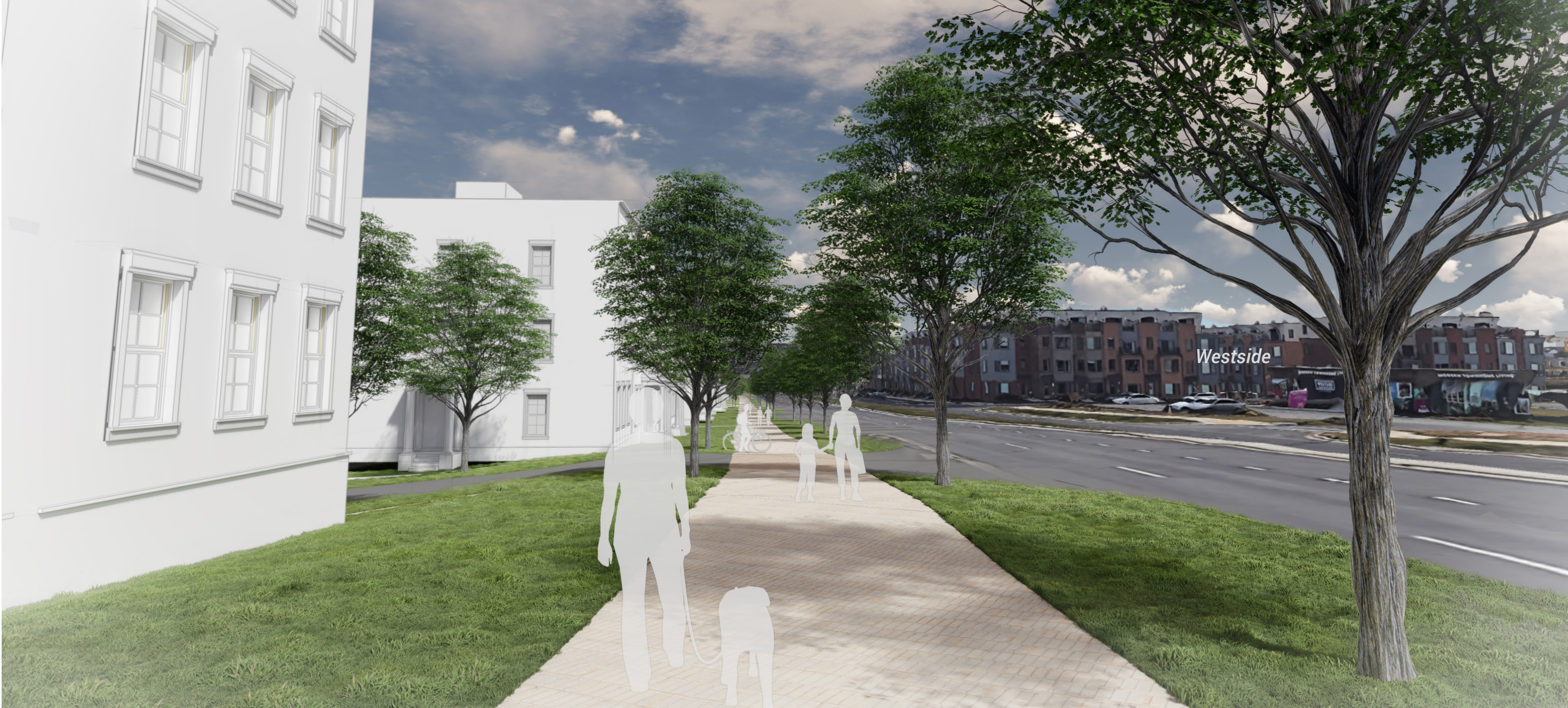
VIEW LOOKING SOUTH, FROM PROPOSED SHARED-USE PATH ALONG CRABBS BRANCH WAY