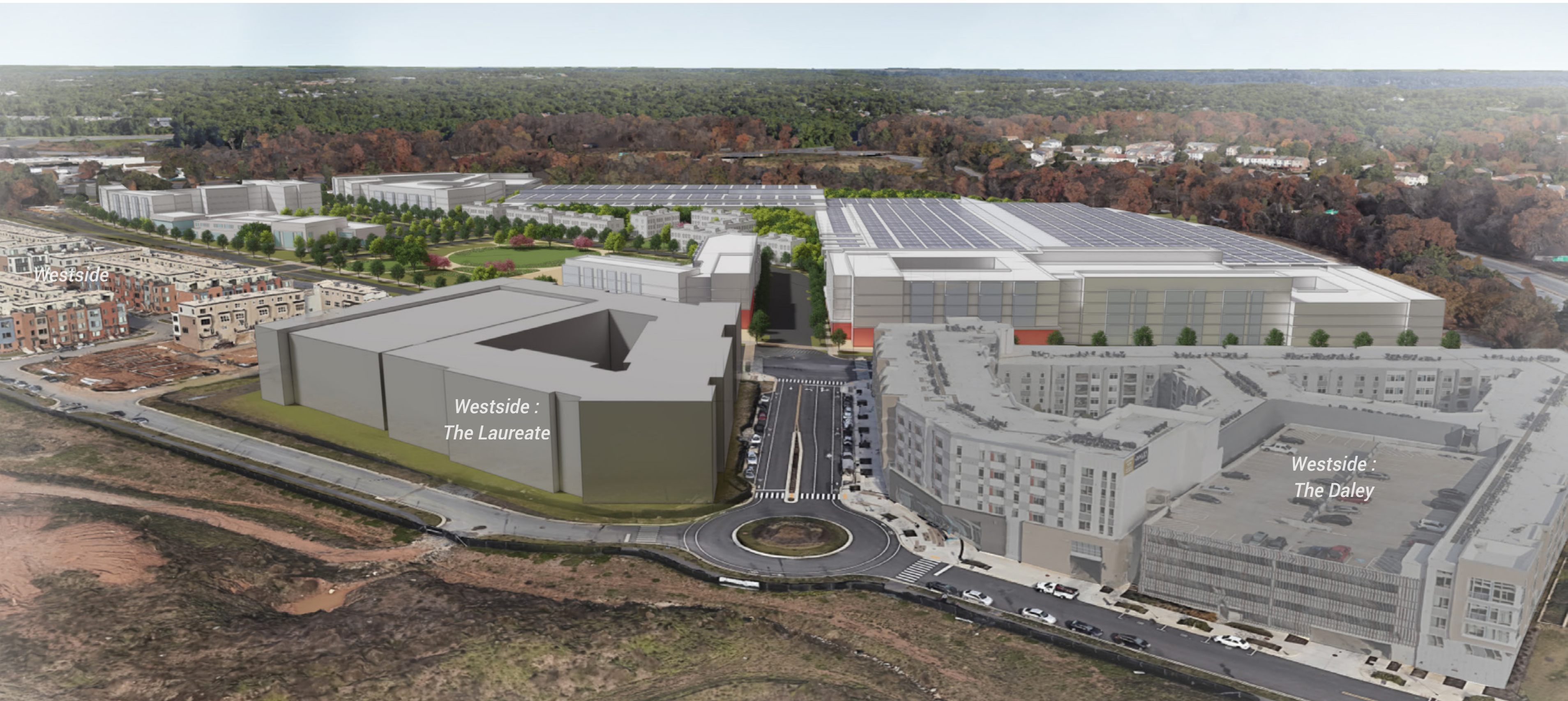
VIEW LOOKING NORTHEAST, OVER WESTSIDE MULTI-FAMILY AND GRAMERCY BLVD.